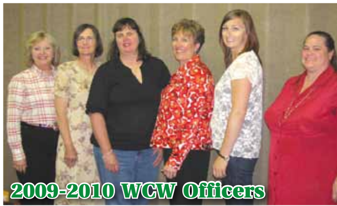
2009-2010 WCW Officers

Check out our new officer bios on pages 2 & 3.