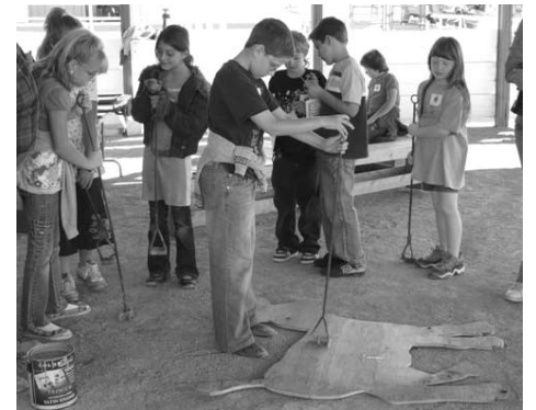
A student gets the chance to learn about branding calves during Ag Day

The fourth grade students are divided into 10 groups. Each group was led by an FFA student or CowBelle. Each student was given a "Celebrate Wyoming Agriculture" vinyl bracelet to wear during the Ag Day. The groups rotate thru the 10 minute sessions. At the end students receive a stick of beef jerky as they board the buses. Teachers are given boxes of packets for the students and themselves. Packets were prepared by the CowBelles and contained numerous educational pamphlets and booklets provided by the Wyoming Cattlewomen, the Beef Council, Wyoming Ag in the Class-