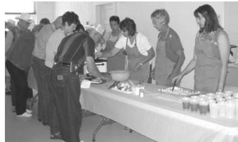
Lunch Time for Texan Ranchers