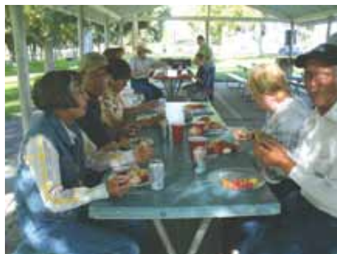
LPCW/LPSG Summer Picnic

After an incredibly beautiful Fall, blustery days are creeping into Platte County reminding us that Winter is on it's way. Everyone is hurrying to complete their seasonal duties before they slip into the routine of daily feeding chores and watching weather patterns.