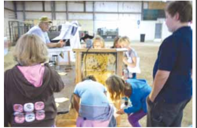
The cross-cut of a honey comb lured students at the Ag Expo

Bee-keeping was added this year as we're always looking for a new cooperator to remind the kids that agriculture touches many areas of their lives. Our FFA student supply for assistance was a bit skimpy as they