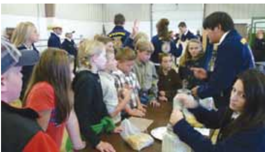
Students answering questions about what a cow does, what it provides, and then they got a chance to milk the cardboard cow. FFA students had a cut out cow with teets and milk that recycles to simulate the hand milking procedure.