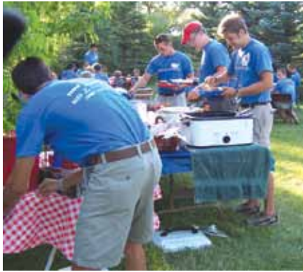
Push America cyclists getting "beefed-up"