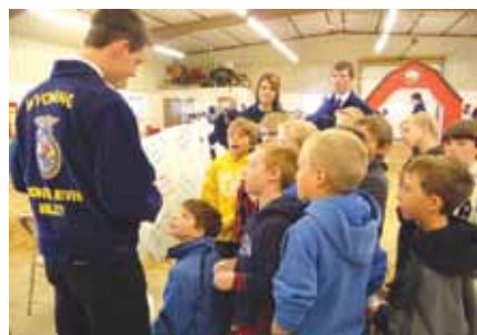
The FFA students take turns churning and one explains how cream makes butter, where the cream comes from and then the 4th grade students sample the butter on a wheat thin cracker.