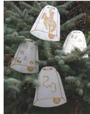
A few of the ornaments made by Lander Valley CattleWomen.

an ad has been placed in the Lander Travel Guide. We will receive $300 from Grass Roots Funding to help with expenses. We are thankful for the support of the Beef Council with that