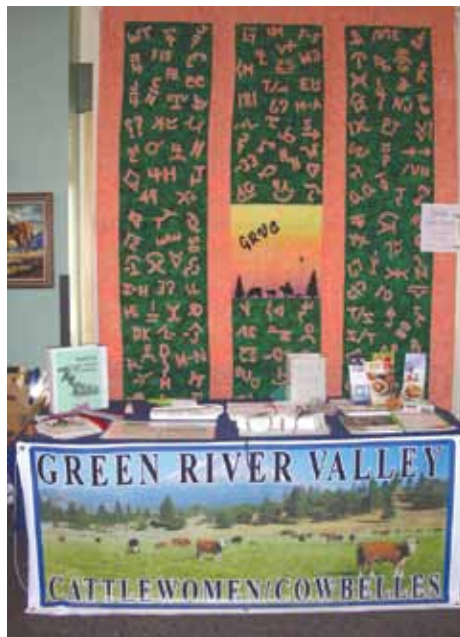
Green River Valley CattleWomen/Cow-Belles new brand quilt.