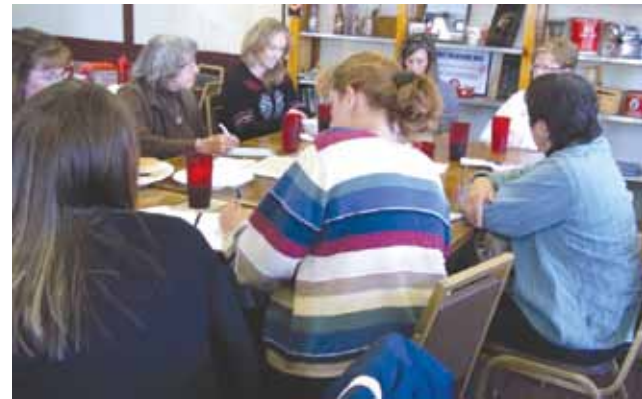
The work force of the LPCW planning future projects.